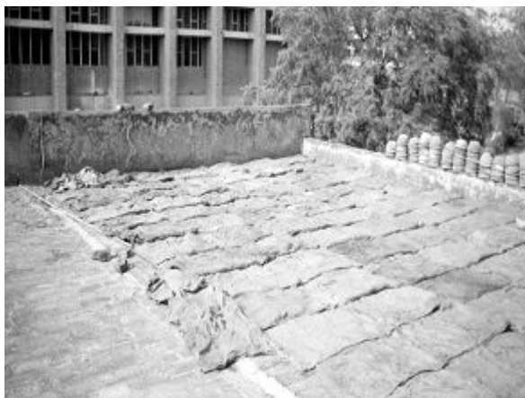
Figure 1: Roof treated with sacks filled with sawdust

These rooms are single storey structures with the roof exposed to sun. Corridors are provided on the east and south sides and, on the west side, there is an adjoining room. No direct radiations reach from these three sides i.e. east, west and south. Direct radiations on the north wall are almost negligible. 62% of the area of the north wall is of glass. There are three window openings in the glass area. There is only one door in the south wall. The treated room had the entire roof covered with bags filled with sawdust in such a manner that it had uniform thickness (see Figure 1).