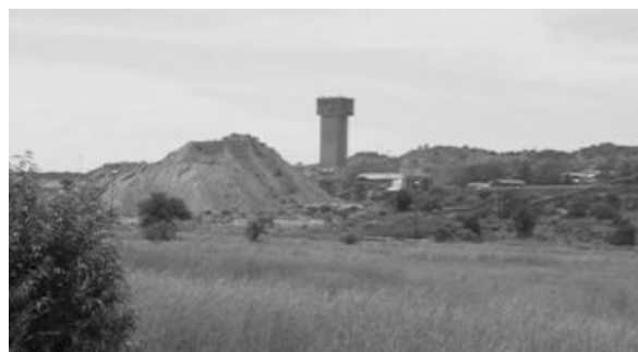
Figure 1: View of the mine

The gold mine is situated near Carltonville. The level on which the project will be implemented is about 100 m below surface and covers an area of around 14 square km.