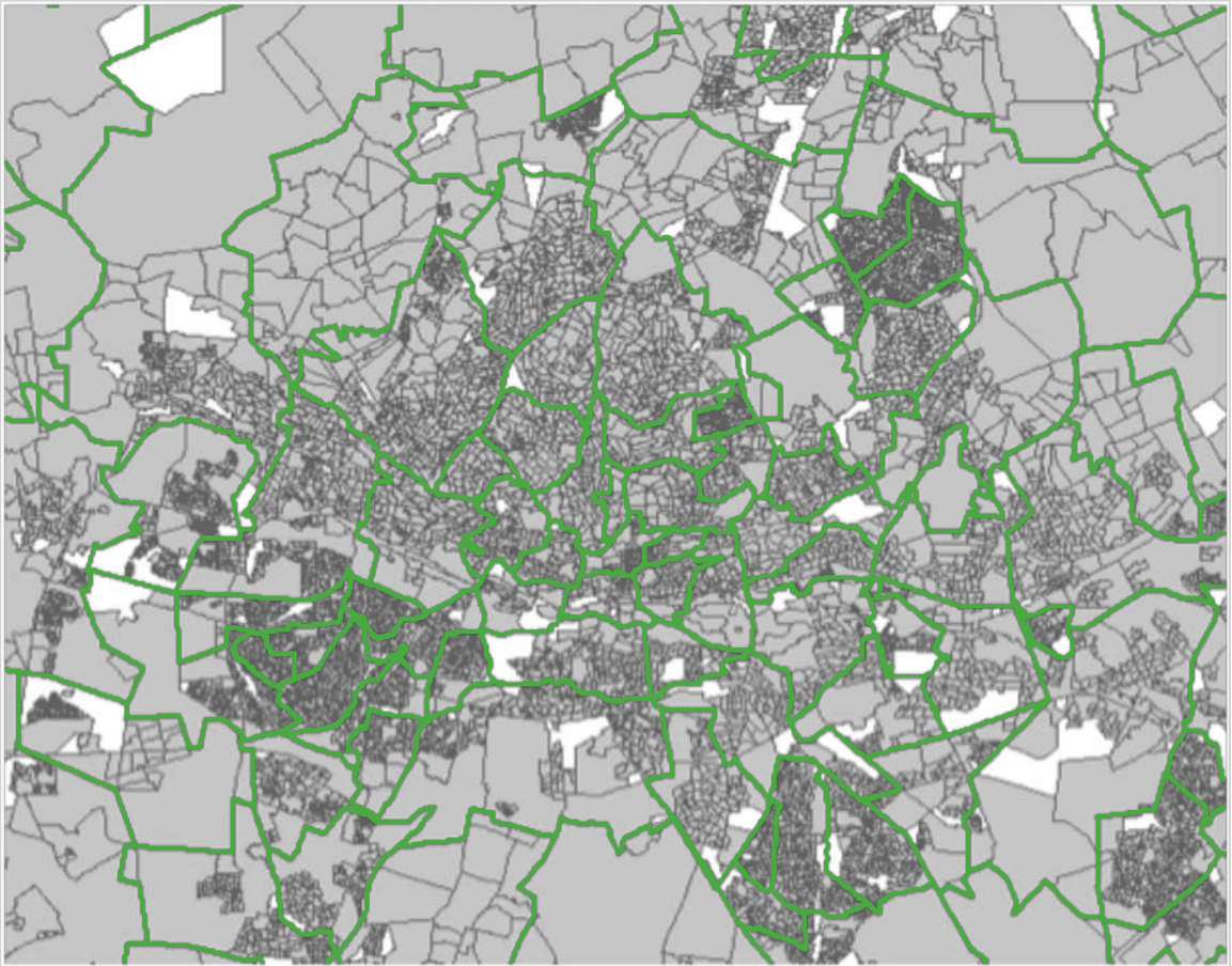
Figure 2: Image of the overlay of precinct boundaries (green lines) with the SAL layer

70% within precinct B, 30% of the population and all related census data are allocated to precinct A, and 70% of the population is allocated to precinct B. Adding up all the small areas and partial small areas within each precinct then gives us an estimated population per precinct.