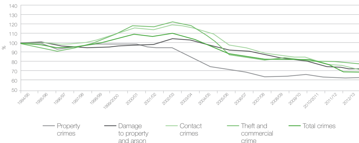
Figure 1: Serious crimes 1994/5 – 2012/13

It is difficult to accurately determine the levels of organised crime anywhere, and South Africa is no exception. 35 Statistics and research on organised crime offer contradictory accounts. For example, while vehicle theft, which often has an organised crime component, 36 dropped from 88 144 incidences in 2004 to 58 312 in 2013, 37 incidences of rhino poaching jumped from 22 to 1 004 in the same period. 38 Similarly, while there was an increase in drug arrests, 39 social research on drug use and gang influence seems to suggest that there has not been a significant change in drug use. 40 The increase in drug arrests could indicate better enforcement rather than an increase in drug trafficking. Or this could be due to factors such as a loosening of power monopolies and