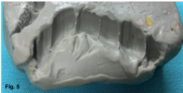
Figure 5. Simulated bitemark using the victim's maxillary dental model.

The examination was performed by comparing the models of the victim's dentition with the clinical photographs and models of the bitemark present on the upper arm of the suspect. An additional pattern association comparison was performed by contrasting the bitemark on the upper arm of the suspect with simulated bitemarks obtained using the victim's dental models to bite into plasticine blocks (Figure 5). Both a macroscopic and microscopic analysis was performed in this case, according to international best practice.