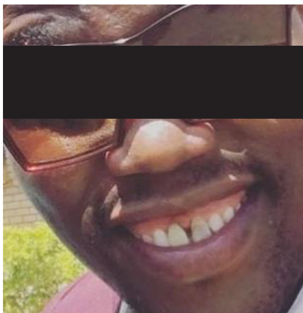
Figure.2 An example of a good selfie with 2 identifiable dental features; midline diastema and non-vital 21.

There was only one selfie collected which showed dental caries in this study (1.6%). In this image it was almost