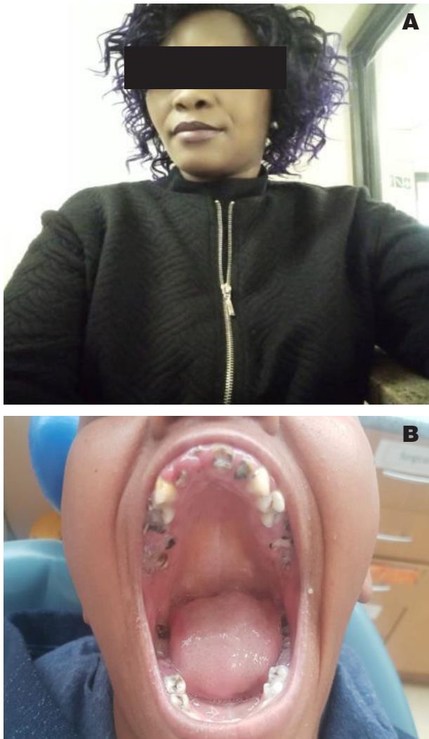
Figure.1A Selfie of an individual with a closed mouth, B Intra-oral image of the same patient's dentition.

as if the individual was trying to conceal the visible dental decay in their smile line by not smiling widely. This finding emphasized the fact that those with decayed teeth chose to not smile in their selfies. Considering that globally 2.3 billion people are estimated to suffer from caries of permanent teeth, it was surprising to note the low number of dental caries seen in the collected selfies. 12