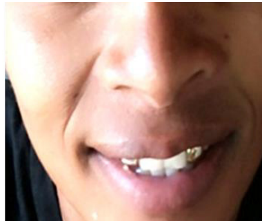
Figure 4. Two full gold crowns on both maxillary lateral incisors (teeth 12 and 22).