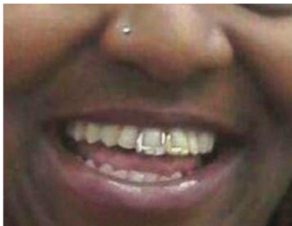
Figure 3 'U' shaped gold inlays on maxillary central incisors (teeth 11 and 21)