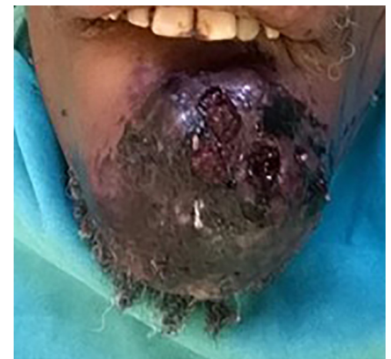
Figure 1: Patient presentation with a maggot-infested anterior mandible

Human myiasis may be classified according to anatomical location. Cutaneous myiasis may be further classified into wound, furuncular and migratory myiasis 4 . Wound myiasis is the most common type encountered. The infestation of larvae in a necrotic lesion is considered to be wound, traumatic or opportunistic myiasis. Myiasis may be caused by a variety of fly species, with a particular species being either obligate, facultative or accidental parasites. Although different species may cause wound myiasis, generally only one species is found in a particular lesion 1 . Cutaneous lesions usually heal well, often with minimal or no scarring 1 . In a South African study by Kuria et al , 25 cases of wound myiasis were diagnosed over a four-year period in the Eastern Cape. The commonly encountered species leading to human myiasis are Lucilia Sericata and Lucilia Cuprina , with the latter