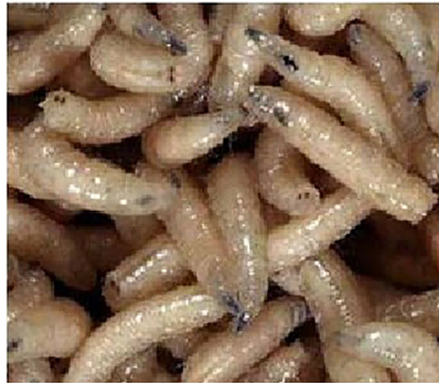
Figure 4: Lucilia sericata , a species used for maggot debridement therapy 6