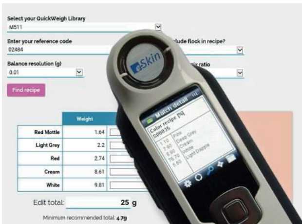
Figure 6: E-skin spectrophotometer and E-skin Calculator 15

of medical and non-medical imaging technologies. Non-medical imaging techniques utilising lasers or intense light beams include intraoral scanners, laser surface scanners, and 3D photogrammetry systems. 4,7,16 In this case, the data required to fabricate the ear template was captured using an intraoral scanner (3 Shape). Visualisation may also be accomplished by means of medical imaging including CT, cone beam computed topography (CBCT), and MRI. 7,17