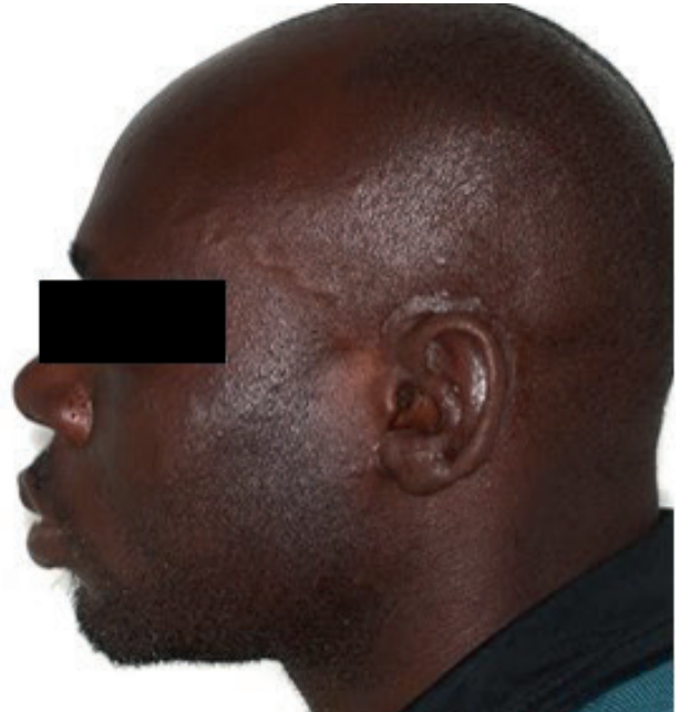
Figures 9 &10: Completed adhesively retained prosthesis.

The normal ear on the contralateral side was accurately inverted and merged with the affected side (the negative volume effect) using the Autodesk Meshmixer software. The prosthesis template was successfully printed using a Phrozen 3D printer. The template was tried-in clinically. It fitted accurately and could be reproduced when required. Tam, McGrath and Ho et al. , 24 found that out of 6 ear templates produced via indirect processing, 4 of the 6 had good marginal accuracy and retention, while 6 of the 6 showed good symmetry and had good position. In this case, although comparison was not the main objective, the clinicians and the patient preferred the 3D printed template over the wax carved template in terms of appearance and accuracy of fit.