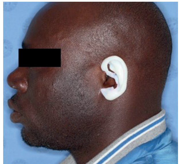
Figures 4 & 5: 3D Printed ear.