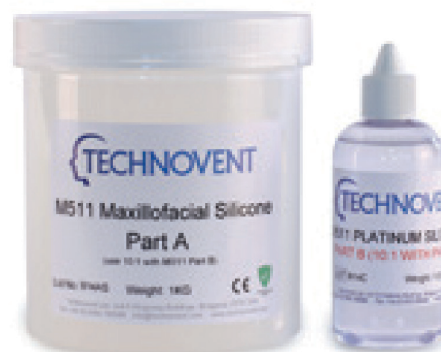
Figures 7 & 8: Recipe weight of colouring system and addition of Platinum Silicon Part A and B according to recipe 15