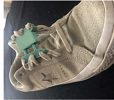
Figure 4: One-handed shoe clip printed from an open-source site.

remould items. It was explicitly noted that a rapid turnaround time is essential in public settings with high patient loads. Participants also noted the concern regarding the ability to adjust and alter the items once printed, as in manual fabrication. The concern was centred around the need for alterations, specifically in the splinting process, to ensure comfort and to meet the patient's individualised needs with their specific condition/ diagnosis.