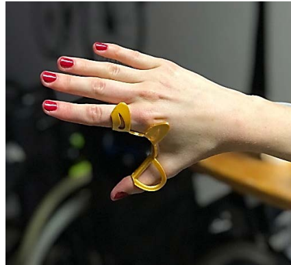
Figure 3: Splint printed from an open-source site.