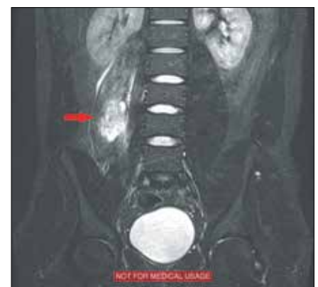
Fig. 1. Short tau inversion recovery (STIR) coronal images demonstrating oedema and circumscribed haematoma in right psoas muscle (red arrow).